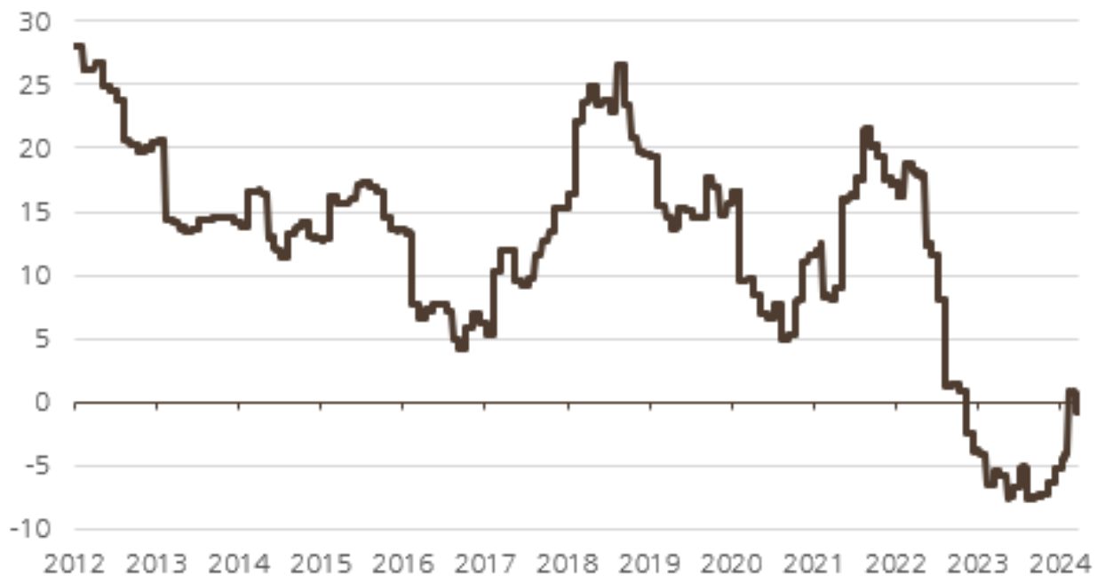
Trailing SG&A expense YoY growth