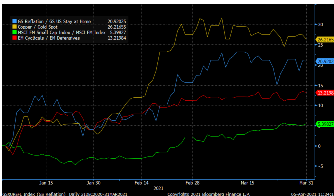
Exhibit 1: Outperformance of relative cyclical expressions in the first quarter of 2021