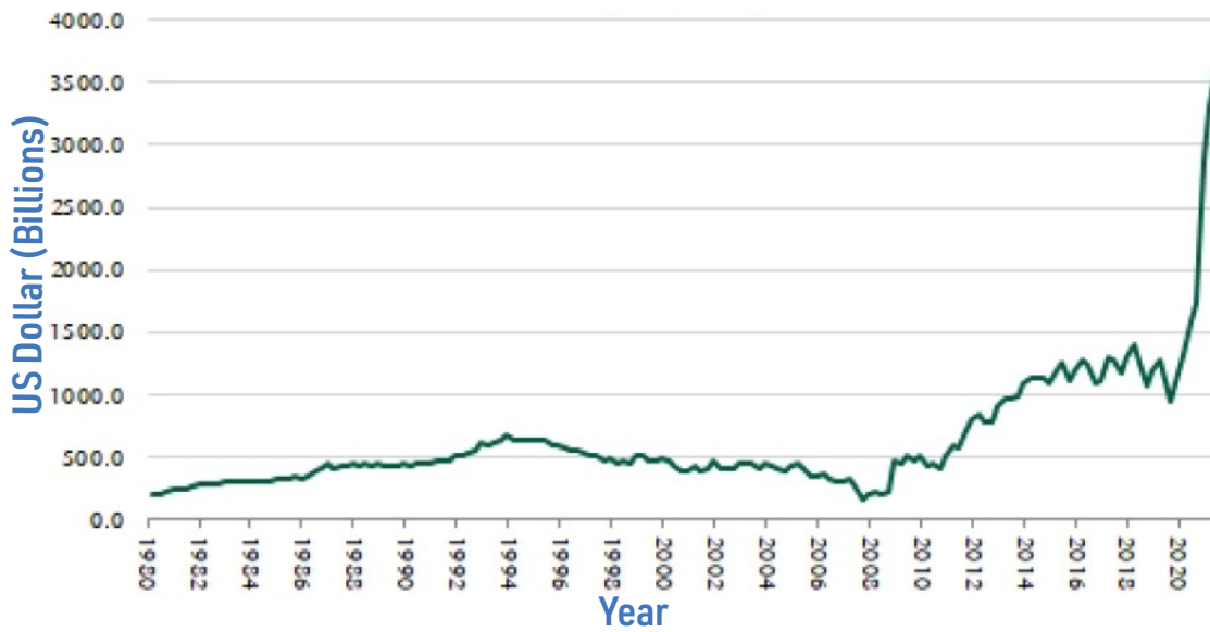
Exhibit 2: Household Cash & Checking Deposits (USD bln)