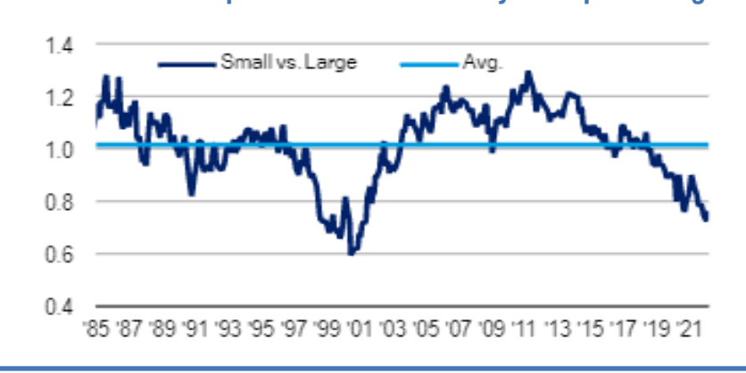
Exhibit 1: Small Caps Remain Historically Cheap vs. Large Caps

The above macro developments have caused a sharp drop in equity prices since November, especially within smaller caps. It is interesting to us how the market is discounting a potential recession much further ahead than it typically does. The market is discounting a very aggressive Fed monetary policy into next year. The Fed has only raised the Fed Funds rate once by 25 basis points and it only stopped buying bonds last month. This price and valuation decline has occurred despite little evidence of a recession in 2022 and as the current level of earnings has risen since the start of the year to all-time highs. The valuation of our portfolio has declined by about 25% as stocks have pulled back and earnings have grown. In terms of P/E levels, valuations have declined from our long-term average of just over 20 times the next twelve months (NTM) forward earnings to the current level of just over 15 times. Additionally, smaller caps trade a sharp discount to large caps as mega caps have behaved in a defensive way. Small caps have frequently traded at a premium to large caps over the past 40 plus years since the inception of the Russell 2000 benchmark. Currently, small caps trade at a sharp discount approaching levels only seen once, just over 20 years ago. Also, across several commonly used valuation metrics, small caps trade at a 20 to 30% discount to large caps. Please see exhibit 1 & 2 below.