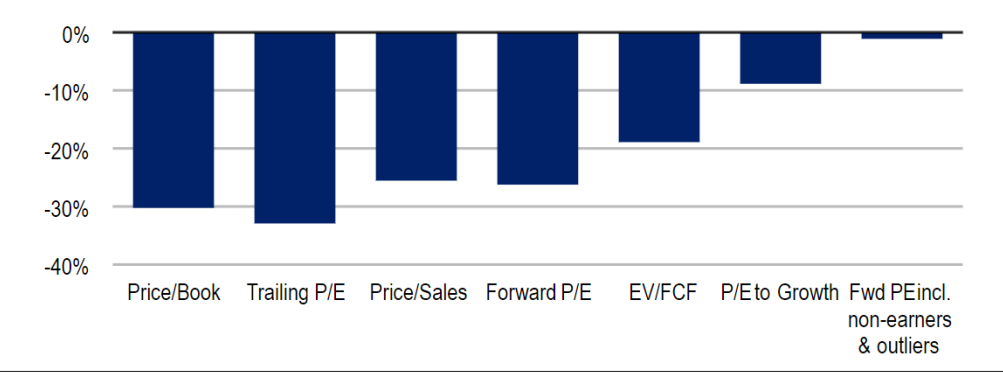
Exhibit 2: Relative Multiple of Small vs. Large Now Trades Below History on Every Metric We Track

Source: BofA US Equity & Quant Strategy, FactSet. A basis point equals 0.01. Trailing price-to-earnings (P/E) : is a relative valuation multiple that is based on the last 12 months of actual earnings. It is calculated by taking the current stock price and dividing it by the trailing earnings per share (EPS) for the past 12 months. Russell 2000 Index: measures the performance of about 2,000 of the smallest publicly traded companies in the U.S. Price-to-Book Ratio ( P/B ratio ): to compare a firm's market capitalization to its book value. It's calculated by dividing the company's stock price per share by its book value per share. Price to Sales Ratio: is a financial metric that measures the value investors put on a company for each dollar of revenue generated by the firm by comparing the stock price with total revenue. Enterprise Value to Free Cash Flow Ratio, or EV / FCF Ratio: contrasts a company's Enterprise Value relative to its Free Cash Flow. It is defined as Enterprise Value divided by Free Cash Flow. Price/Earnings to Growth Ratio (PEG ratio): is a stock's price-to-earnings(P/E) ratio divided by the growth rate of its earnings for a specified time period.