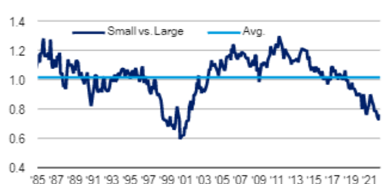
Exhibit 1: Small Caps Remain Historically Cheap vs. Large Caps

The above macro developments have caused a sharp drop in equity prices since November, especially within small/mid caps. It is interesting to us how the market is discounting a potential recession much further ahead than it is typically does. The market is discounting a very aggressive Fed monetary policy into next year. The Fed has only raised the Fed Funds rate once by 25 basis points and it only stopped buying bonds last month. This price and valuation decline has occurred despite little evidence of a recession in 2022 and as the current level of earnings has risen since the start of the year to all-time highs. The valuation of our portfolio has declined by about 25% as stocks have pulled back and earnings have grown. In terms of P/E levels, valuations have declined from our long-term average of just over 20 times the next twelve months (NTM) forward earnings to the current level of just over 15 times. Additionally, small caps trade a sharp discount to large caps as mega caps have behaved in a defensive way. Small caps have frequently traded at a premium to large caps over the past 40 plus years since the inception of the Russell 2000 benchmark. Currently, small caps trade at a sharp discount approaching levels only seen once, just over 20 years ago. Also, across several commonly used valuation metrics, small caps trade at a 20 to 30% discount to large caps. Please see exhibit 1 & 2 below.