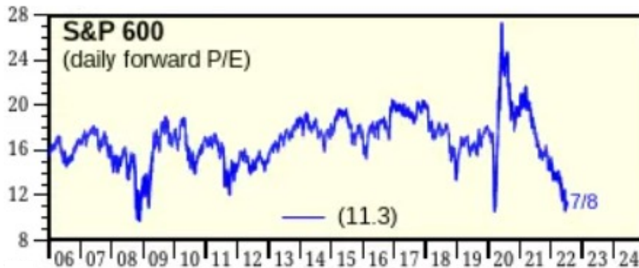
Exhibit 2: Small Cap Forward P/Es Near the Global Financial Crisis and Covid Recession Bottoms